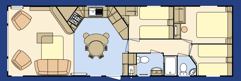
39 x 12-6 – 3 bedroom/8 berth