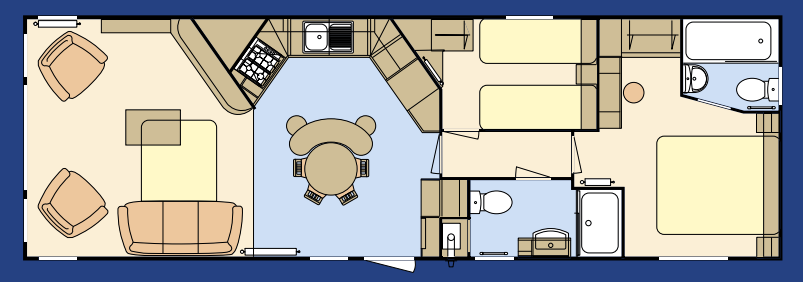
38 x 12-6 – 2 bedroom/6 berth