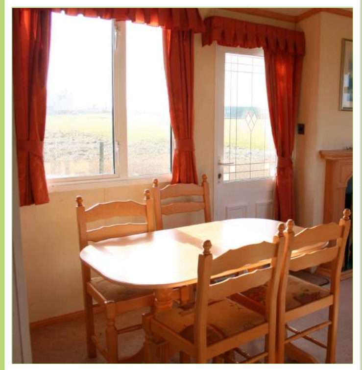
DINING AREA Opposite the kitchen is a spacious dining area, with a good sized oblong table and four chairs.